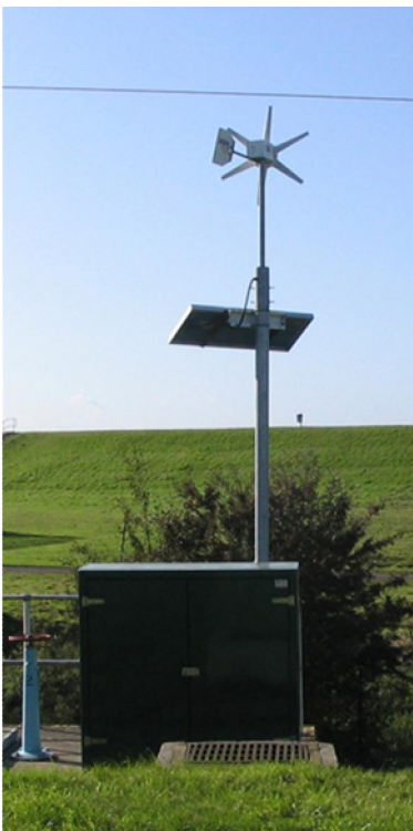
A low energy remote power site where a grid connection would otherwise cost thousands of pounds